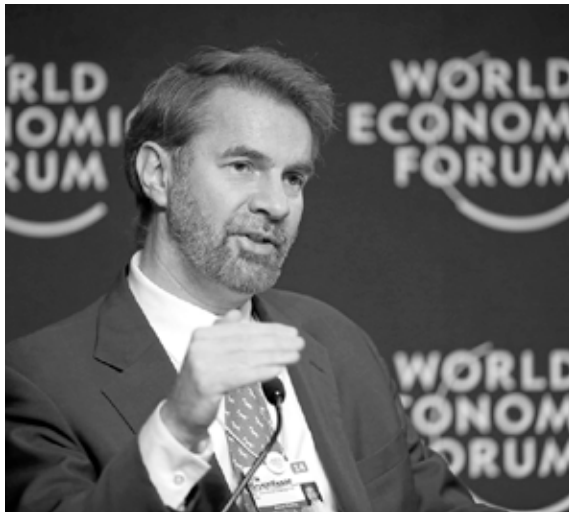
Erik Brynjolfsson at the WEF, Davos

The idea of "universal basic income" (UBI) has been embraced by prominent economists and philosophers from the left and right (Friedrich Hayek, Robert Nozick, Milton Friedman, Robert Solow, Herbert Simon, Thomas Piketty). It currently experiences a worldwide revival: At this year's World Economic Forum in Davos along with the discourse about the "4th Industrial Revolution", a UBI was proposed as a promising concept in the context of upcoming disruption of traditional labour markets (e.g.: Erik Brynjolfsson MIT).