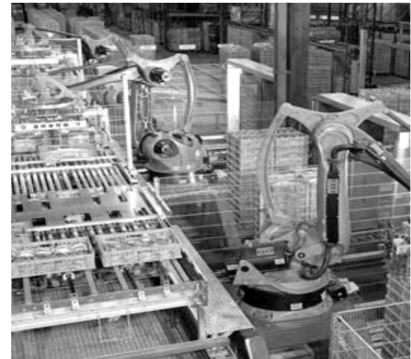
Robots working for us

Switzerland, as the first nation in world history, will vote in June 2016 on a promising proposal of social innovation: a universal basic income (UBI).